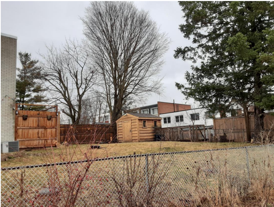
Image 4: view of rear yard (it is noted that the existing shed and pen shown above are to be removed from the property).