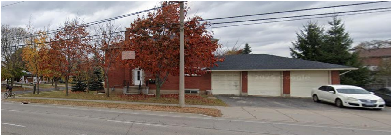
Figure 5 – Existing 3 Unit Multiple Dwelling at 11 Pinecrest Drive

Planning staff is of the opinion that the requested Official Plan Amendment will facilitate a low-rise housing form that conforms with the Low Rise Residential land use designation in the City's Official Plan. The proposal provides an additional low density housing type within the neighbourhood with a maximum FSR of 0.84.