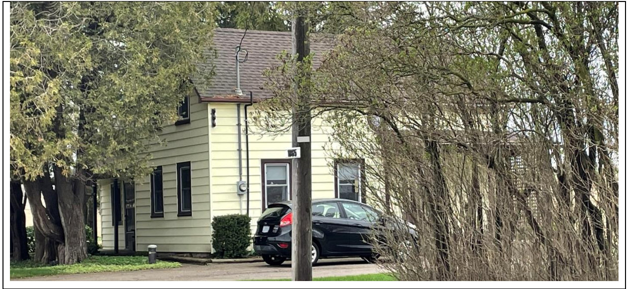
Front & Side Elevation (South & East Façade) (2025)