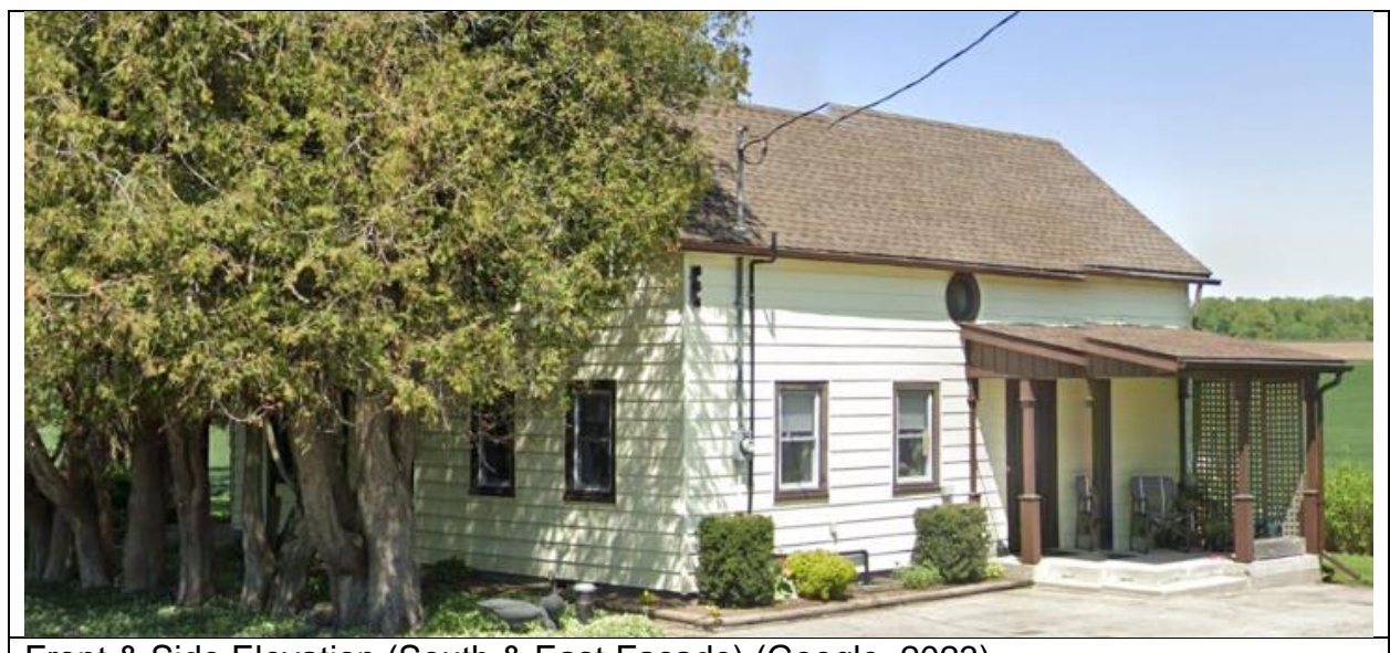
Front & Side Elevation (South & East Façade) (Google, 2023)