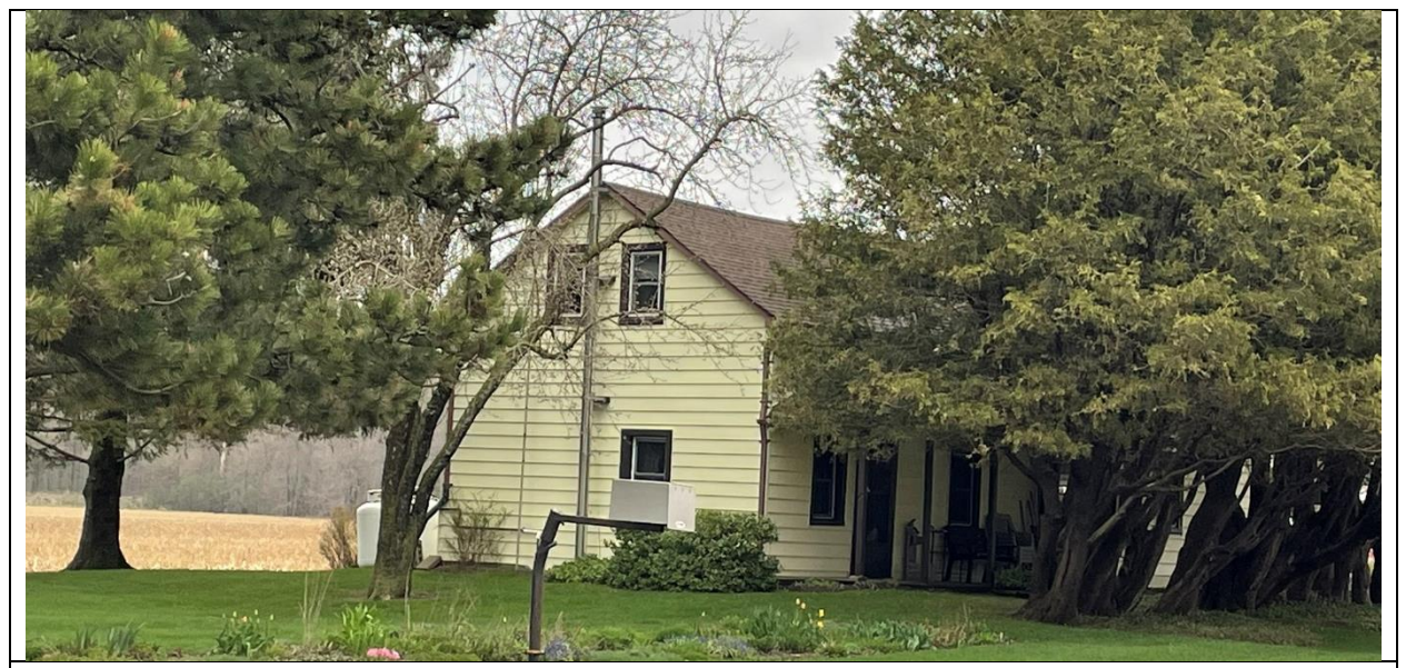
Side & Front Elevation (West & South Façade)