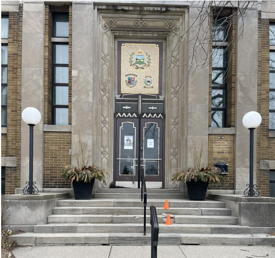
Figure 1.0 Exterior Limestone Steps at 122 Frederick Street

2016-IV-009) approved the repair of two of these limestone steps. At least one limestone step must be replaced. Several others show various levels of deterioration and may require repair and/or replacement.