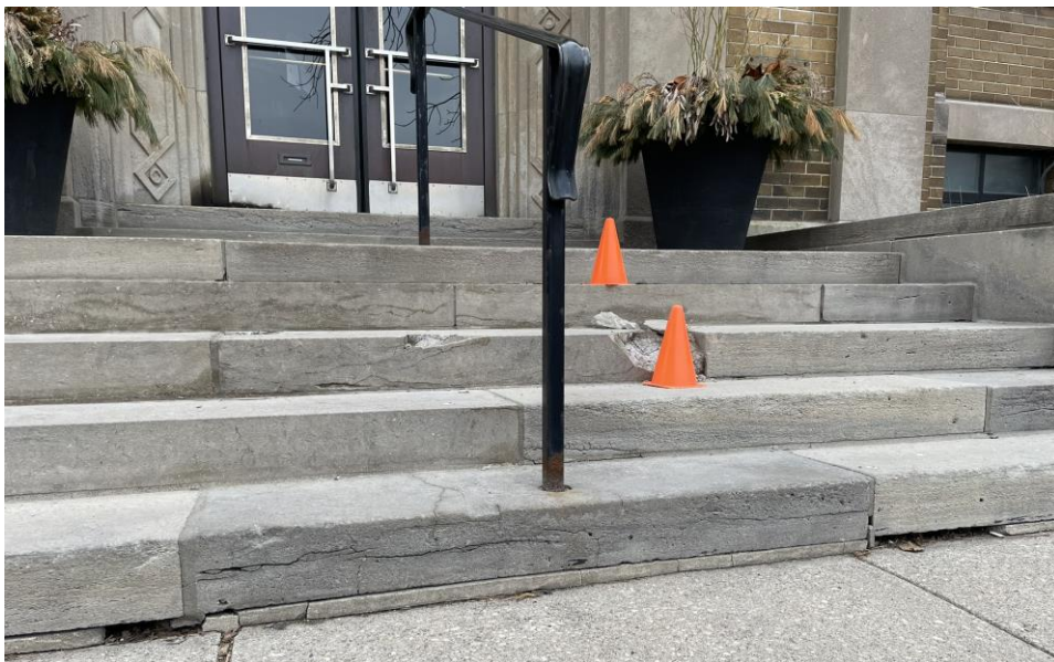
Figure 2.0 Existing Condition of Exterior Limestone Steps at 122 Frederick Street