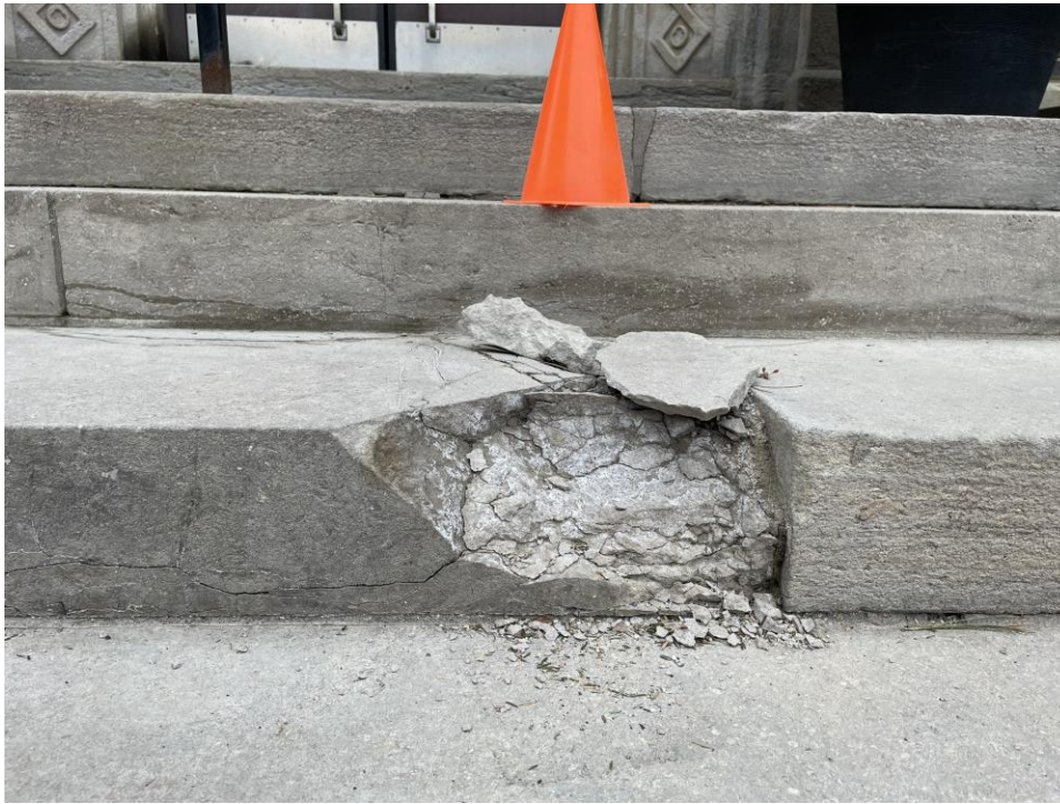
Figure 3.0 Exterior Limestone Step that Requires Replacement at 122 Frederick Street

It is anticipated that the scope of work may involve both repair of existing mortar and limestone, and the replacement of existing limestone.