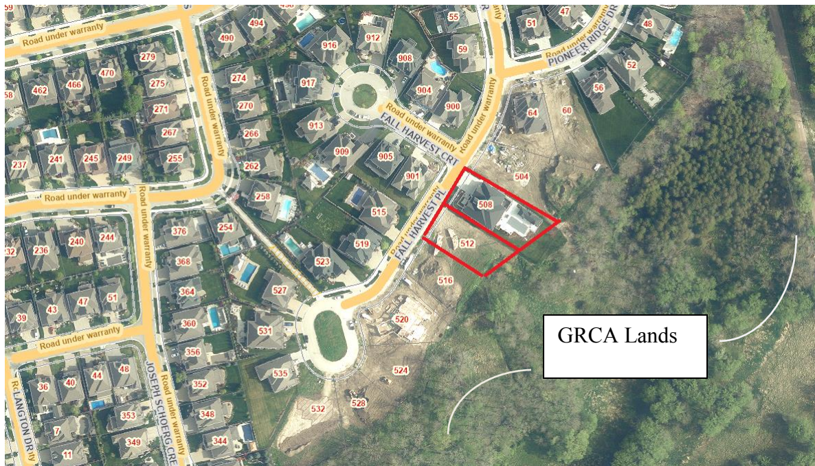
Figure 1 – Aerial photo of 508 and 512 Fall Harvest Place

The subject property is identified as ‘Community Areas’ on Map 2 – Urban Structure and is designated ‘Low Rise Residential’ on Map 3 – Land Use in the City’s 2014 Official Plan.