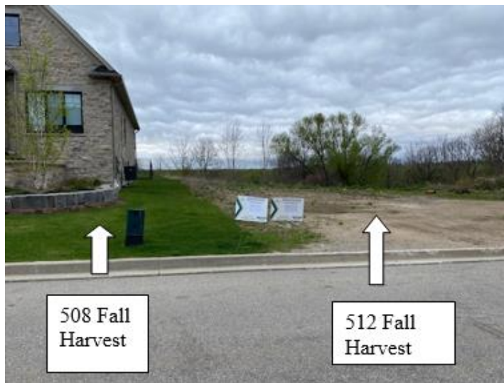
Figure 3 – Photo of 508 and 512 Fall Harvest Place

A site visit occurred on May 4, 2025 (see Figure 3).