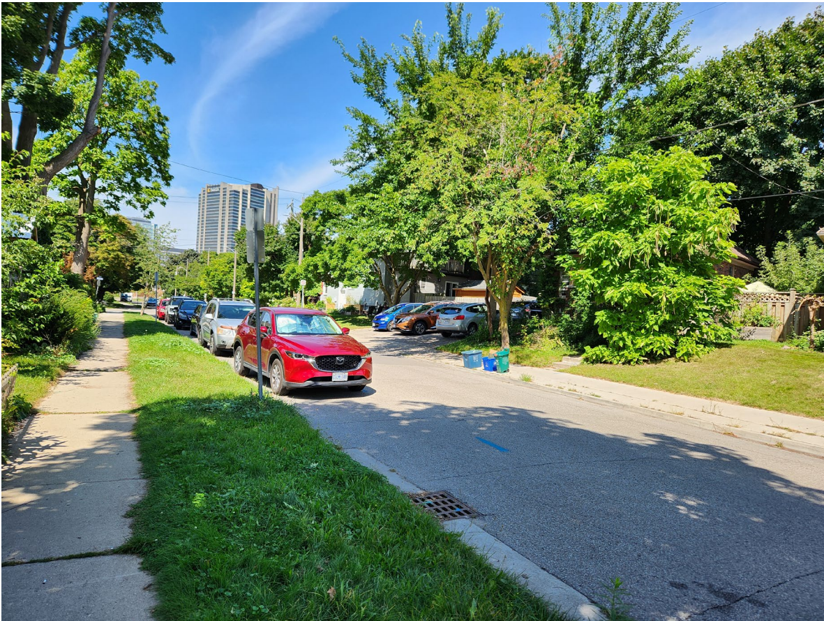
Figure 7: York Street Facing North Directly Beside Subject Property