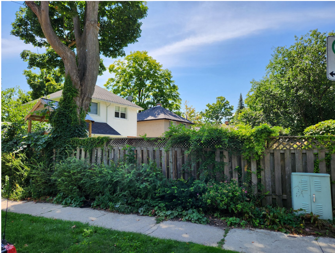
Figure 8: Proposed Driveway Location between City tree and Utility Box