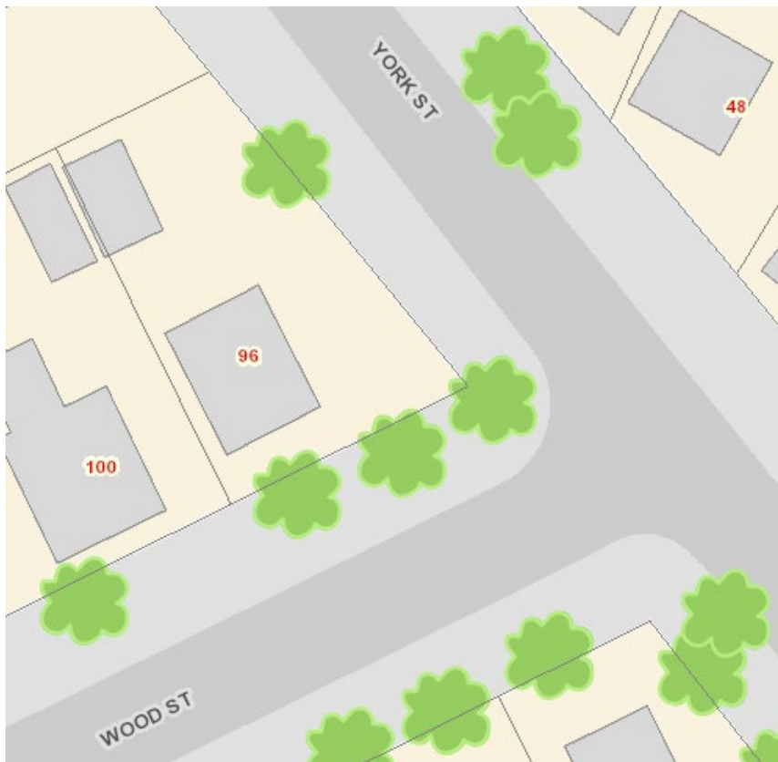
Figure 9: Location of City Trees