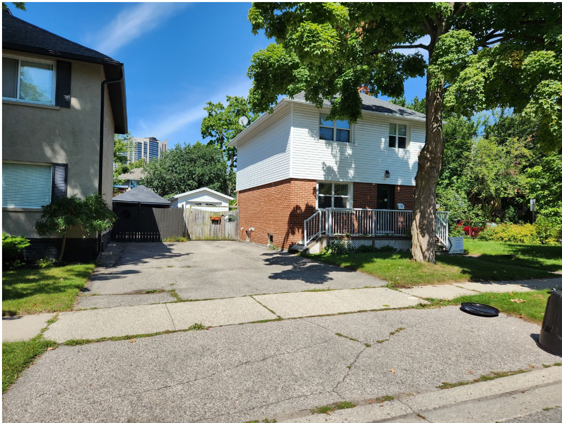
Figure 5: Existing Driveway and Detached Garage