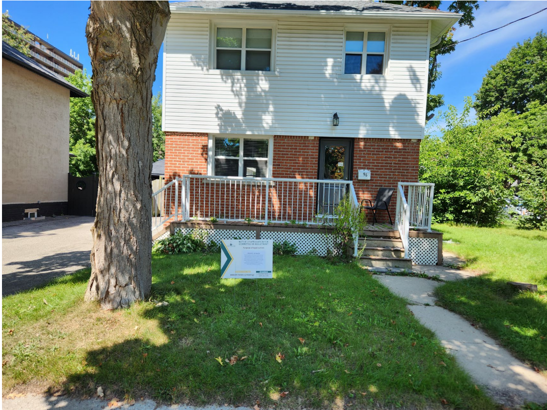
Figure 4: Front of Existing House (Wood Street Façade)