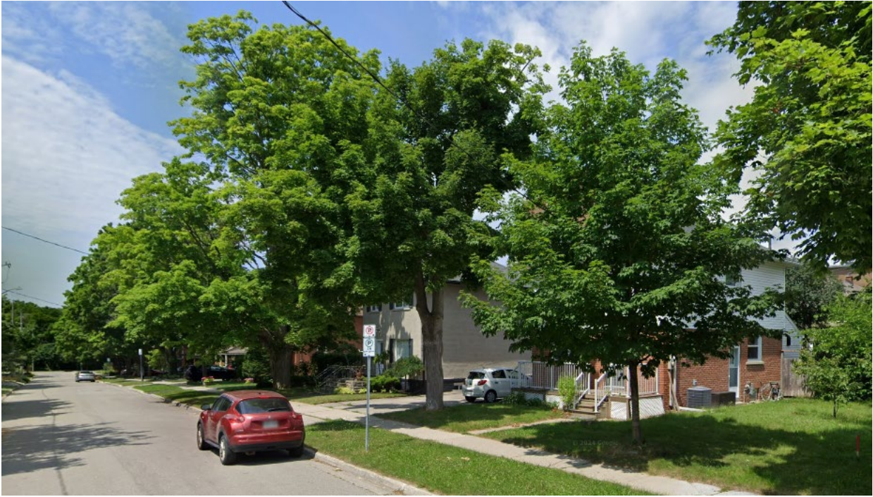
Figure 6: Existing House and Wood Street Streetscape