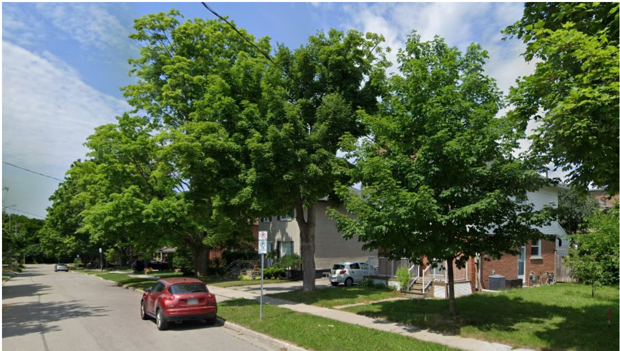
Figure 6: Existing House and Wood Street Streetscape