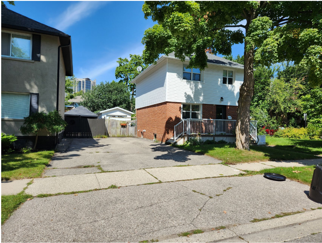
Figure 5: Existing Driveway and Detached Garage