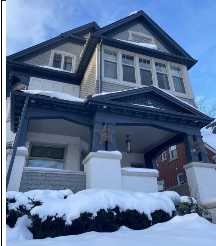
Front Elevation (South East Façade)