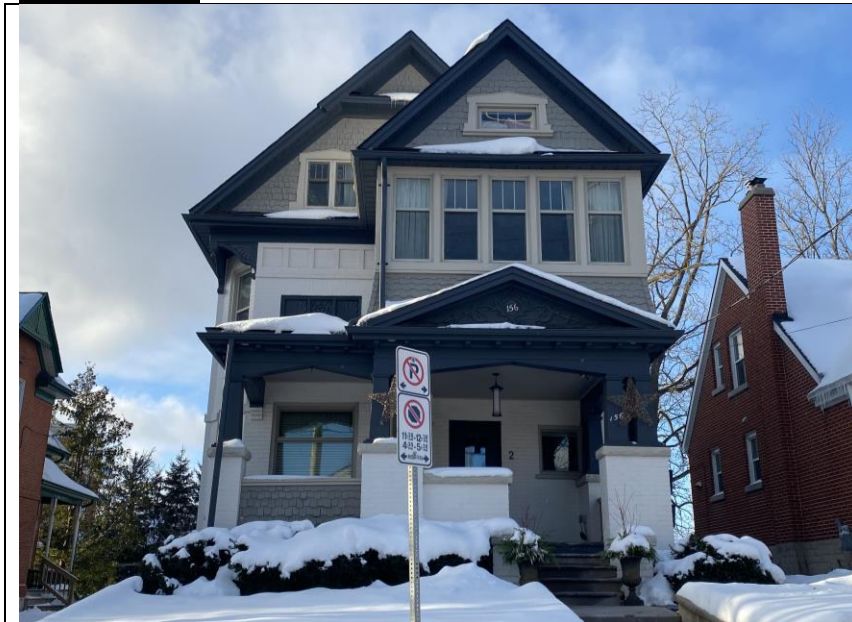
Front Elevation (South East Façade)