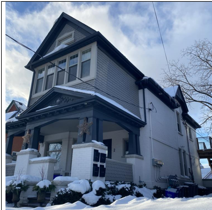
Front and Side Elevation (South East and North East Façade)