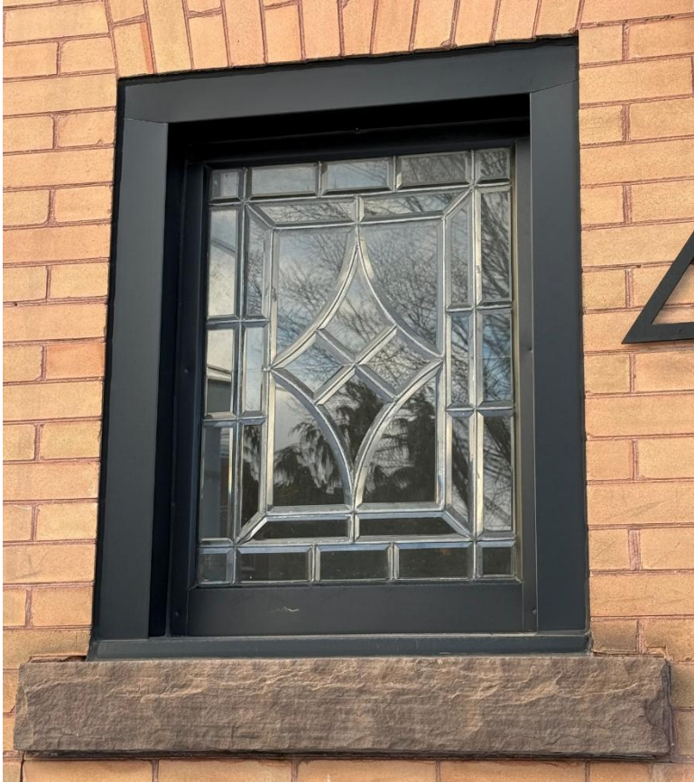
Figure 8: 42 Francis Street North, image showing square stained glass window detail.