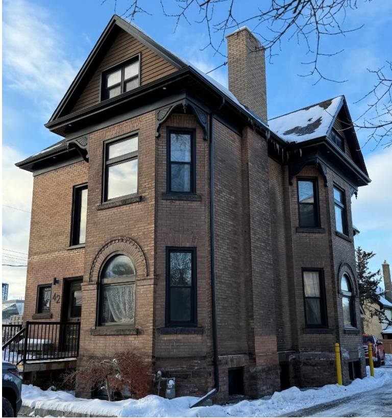
Figure 2: 42 Francis Street North (Front and Side Elevation)