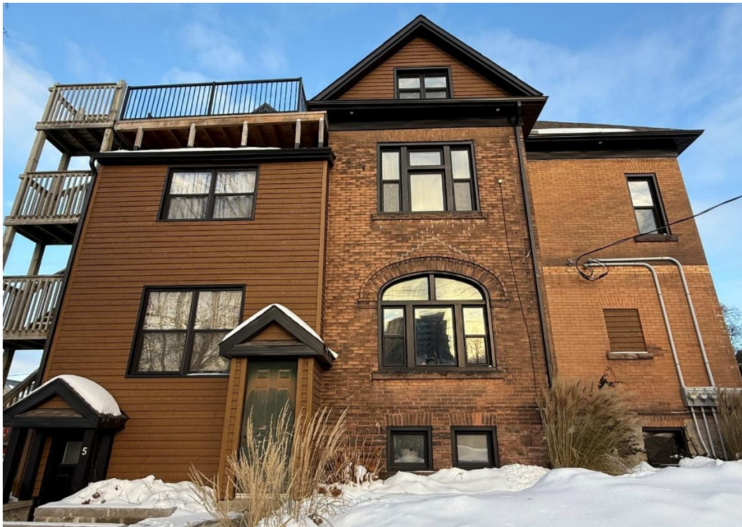
Figure 3: 42 Francis Street North (Side Elevation)