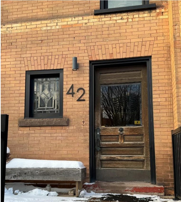
Figure 6: 42 Francis Street North, image showing original wooden door, and square stained glass window.