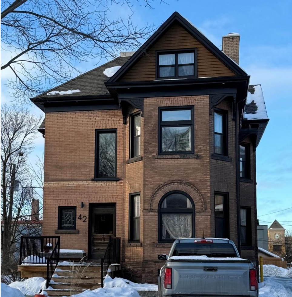
Figure 1: 42 Francis Street North (Front Elevation)