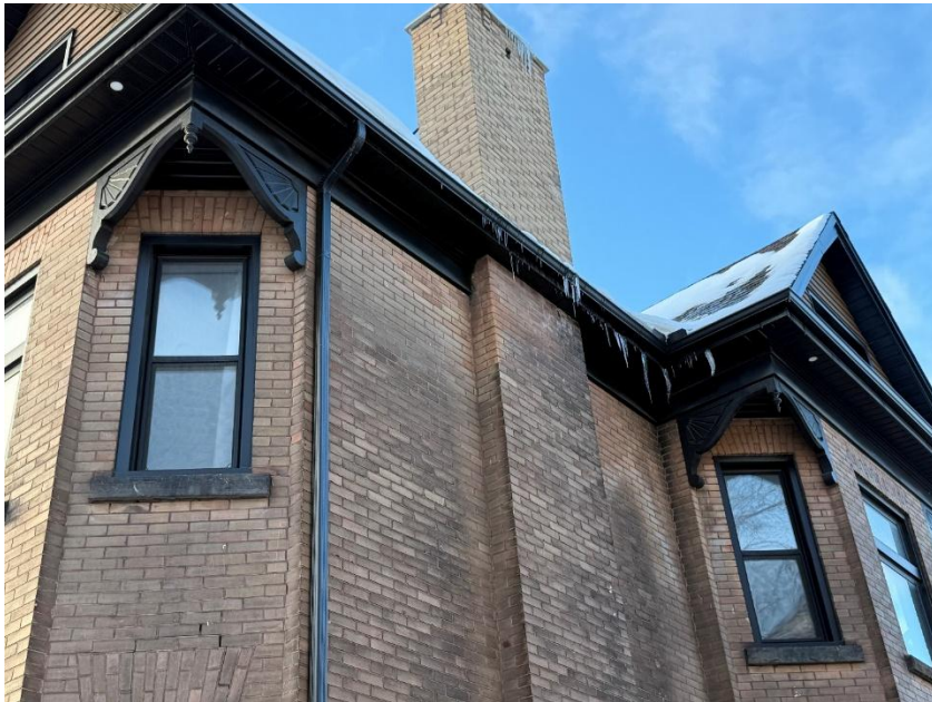
Figure 5: 42 Francis Street North, image showing cornice detail.