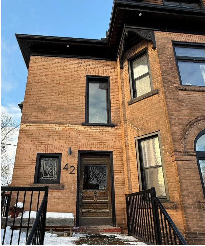
Figure 4: 42 Francis Street North (Front Elevation)