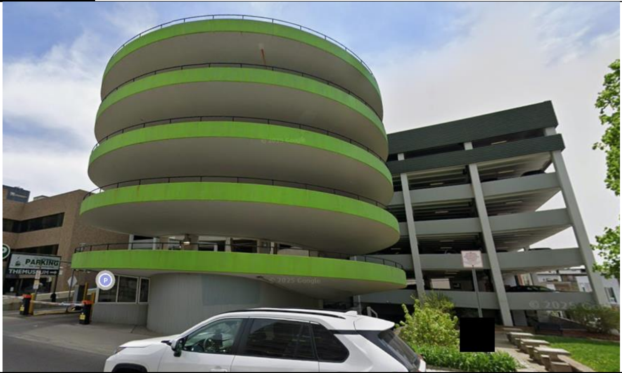
Front (Duke Street West) Elevation (East Façade) – 33 Ontario Street South (Google, May 2025)