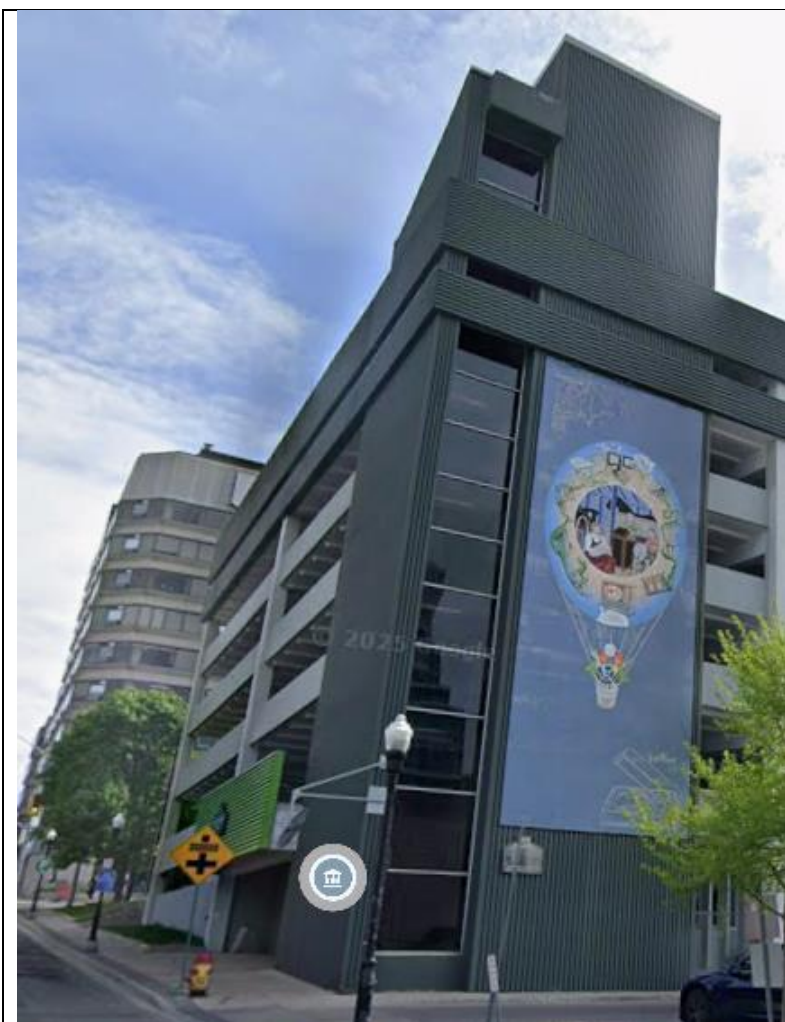
Rear (Halls Lane) Elevation (South Façade) – 33 Ontario Street South