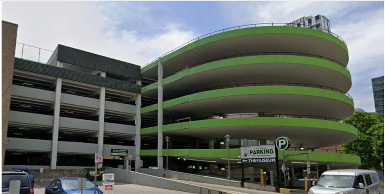
Front (Duke Street West) Elevation (East Façade) – 33 Ontario Street South (Google, May 2025)