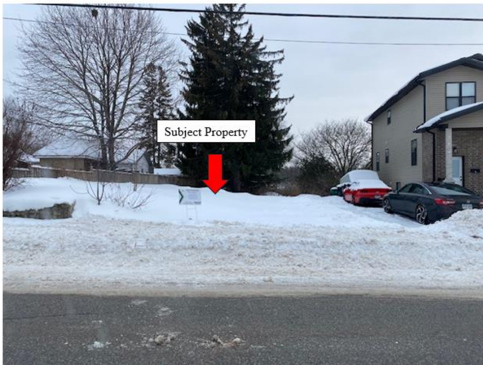
Figure 2 – Photograph of Subject Property

The purpose of the application is to seek approval of 3 variances for the existing lot width, the side yard setback to a parking area and the side yard setback for a multiple dwelling, which are required to facilitate the plan shown in Figure 3 below: