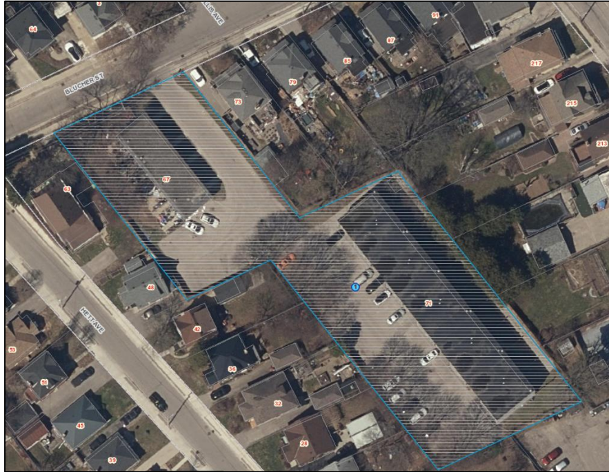
Figure 1: Location Map:67-71 Blucher Street

The subject property is located on the south side of Blucher Street between Hett Avenue and Ellis Street.