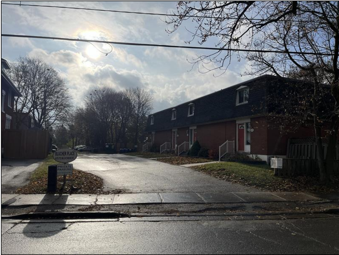
Figure 2: View of Subject Lands from Blucher Street (November 21, 2025)

With the subject applications discussed in this report, the applicant is seeking to separate the lot into two lots, one which would contain the existing 10 unit cluster townhouse building on 71 Blucher (Severed lands) and one which would currently contain the 4 unit cluster townhouse building and is proposed to be developed with two new stacked townhouse buildings totalling 16 units on 67 Blucher Street (Retained lands).