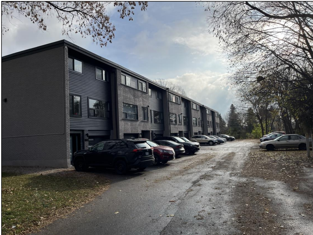
Figure 4: View of Existing 10-Unit Cluster Townhouse Dwelling at 71 Blucher Street (November 21, 2025)

It is noted that a Reference Plan and Building Location Survey were not provided and submitted with the Consent Applications. The Applicant is submitting these applications