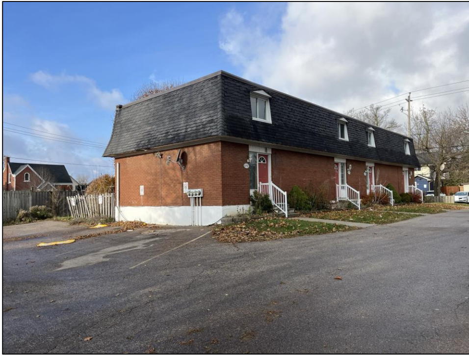
Figure 3: View of Existing 4-Unit Cluster Townhouse Dwelling at 67 Blucher Street (November 21, 2025)