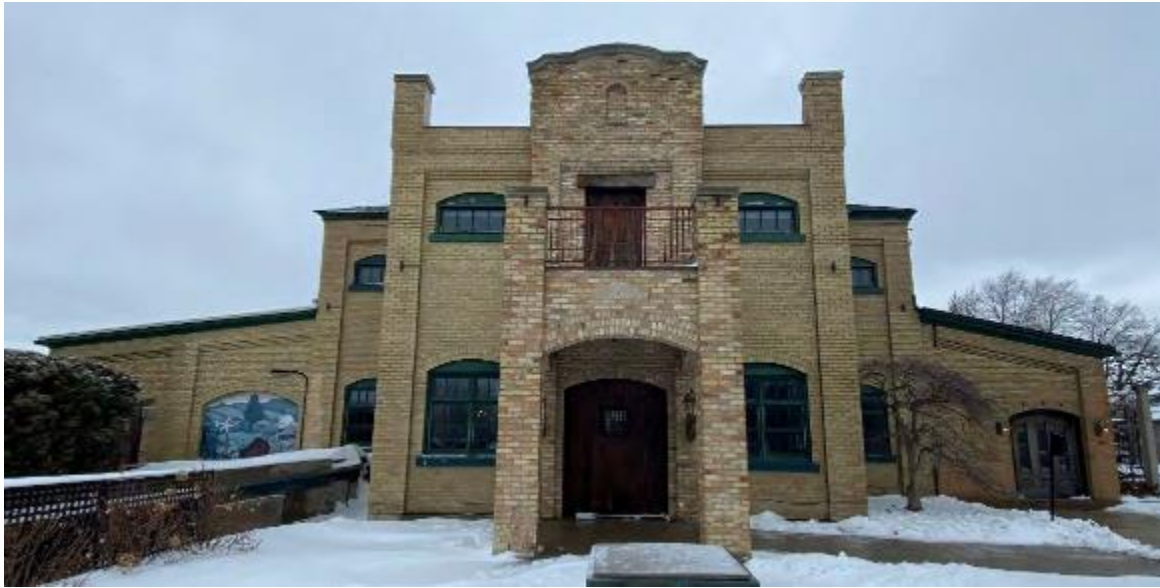
Figure 3. Front Façade of the Former Warehouse Building with Spanish Eclectic Influences.

top. The addition covered most of the front façade of the original building, leaving only a bay of windows on each side of the original façade visible from the street. There is a single-storey addition on each side of the building that was constructed between 1904 and 1925.