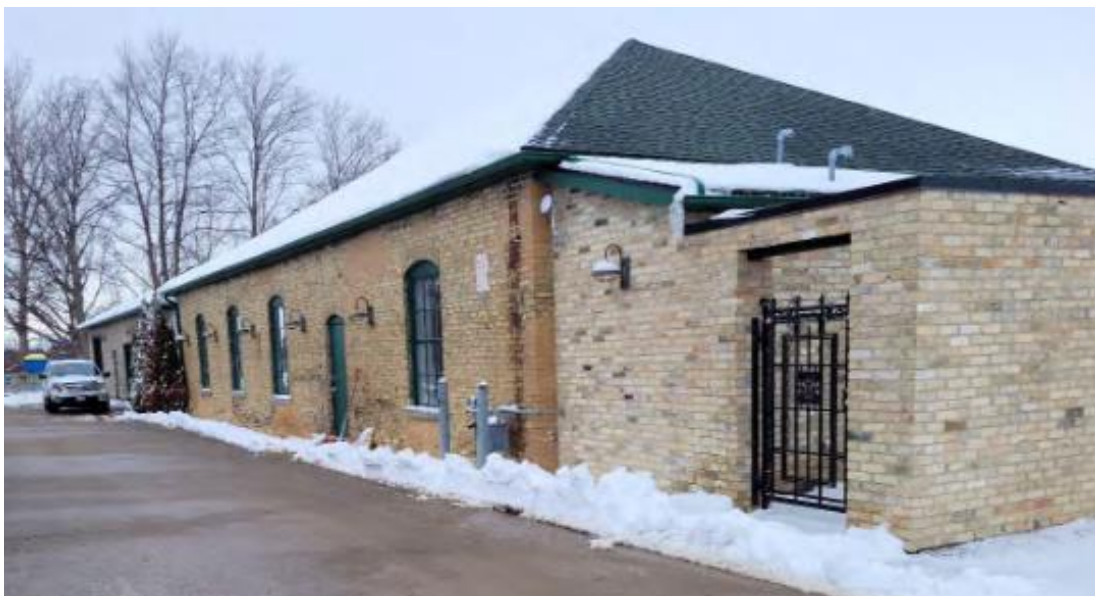
Figure 4. Former Machine Shop

The original portion of the Former Machine Shop was built in 1902, with an addition that was constructed between 2017 and 2018 (Fig. 4). The building is one-storey in height, of tan brick construction with a hipped roof and arched windows.