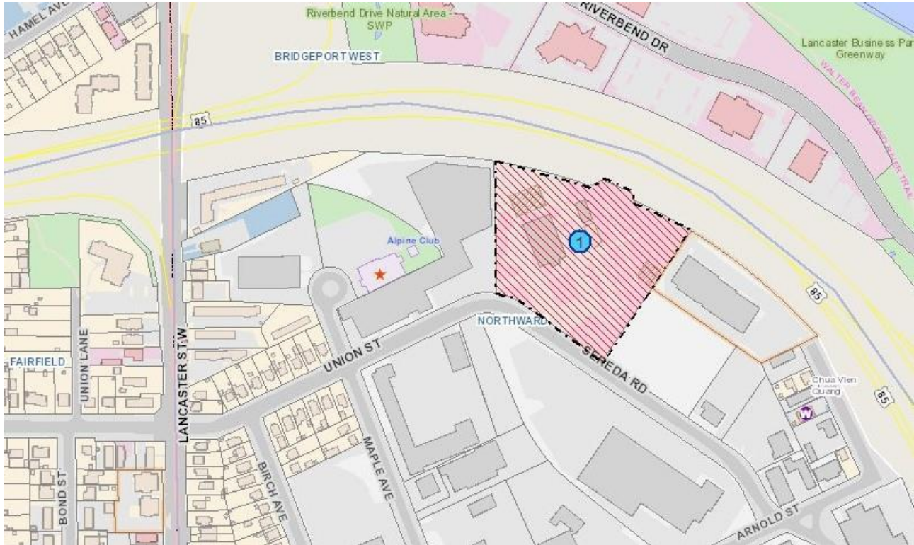
Figure 1. Location Map – 1254 Union Street

1254 Union Street includes a two-storey warehouse building, two single storey buildings to the east, a temporary structure to the southeast and various landscape components situated on a 5.65 acres of land located on the south side of Union Street just before Union Street turns into Sereda Road (Fig. 1). The subject property is located in the Northward Planning Community in the City of Kitchener within the Region of Waterloo.