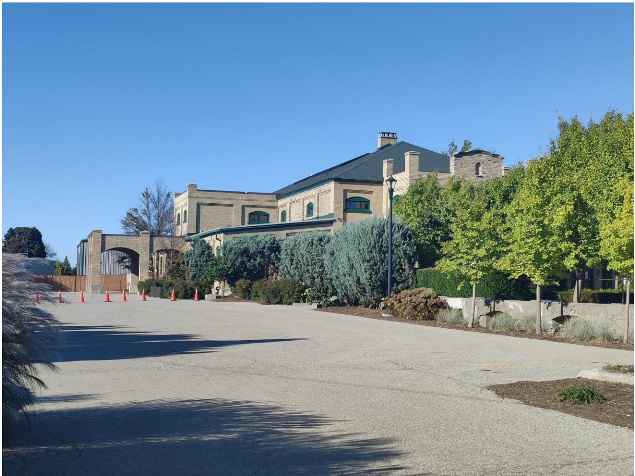
Figure 2. Front and Side Elevation of original former Warehouse Building.

Identifying and protecting cultural heritage resources within the City of Kitchener is an important part of planning for the future, and helping to guide change while conserving the buildings, structures, and landscapes that give the City of Kitchener its unique identity. The City plays a critical role in the conservation of cultural heritage resources. The designation of property under the Ontario Heritage Act is the main tool to provide long-term protection of cultural heritage resources for future generations. Designation recognizes the importance of a property to the local community; protects the property's cultural heritage value; encourages good stewardship and conservation; and promotes knowledge and understanding about the property. Designation not only publicly recognizes and promotes awareness, but it also provides a process for ensuring that changes to a property are appropriately managed and that these changes respect the property's cultural heritage value and interest.