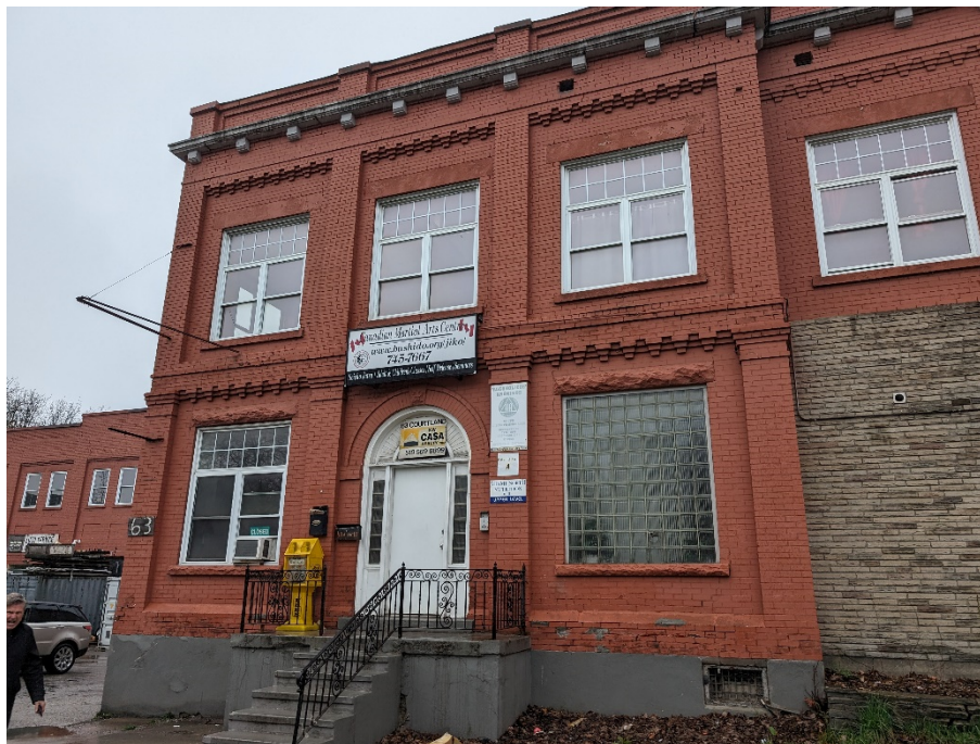
Photograph 1: Overview

A site visit was carried out by Nick Lawler, P.Eng. on April 19, 2024 to complete the assessment.