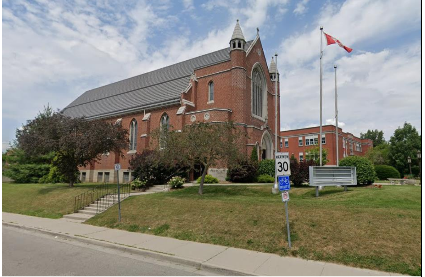
85 Strange Street