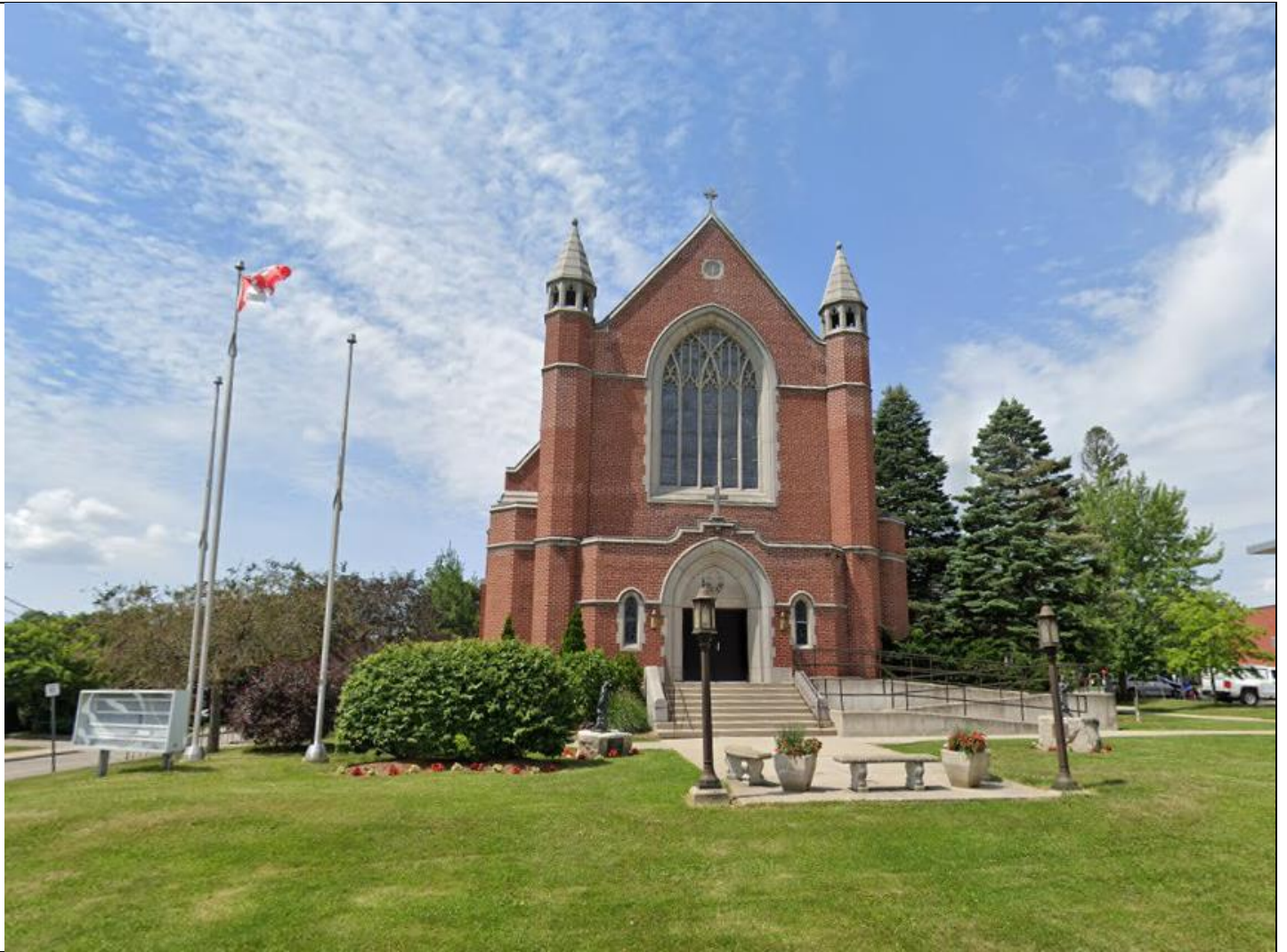
85 Strange Street