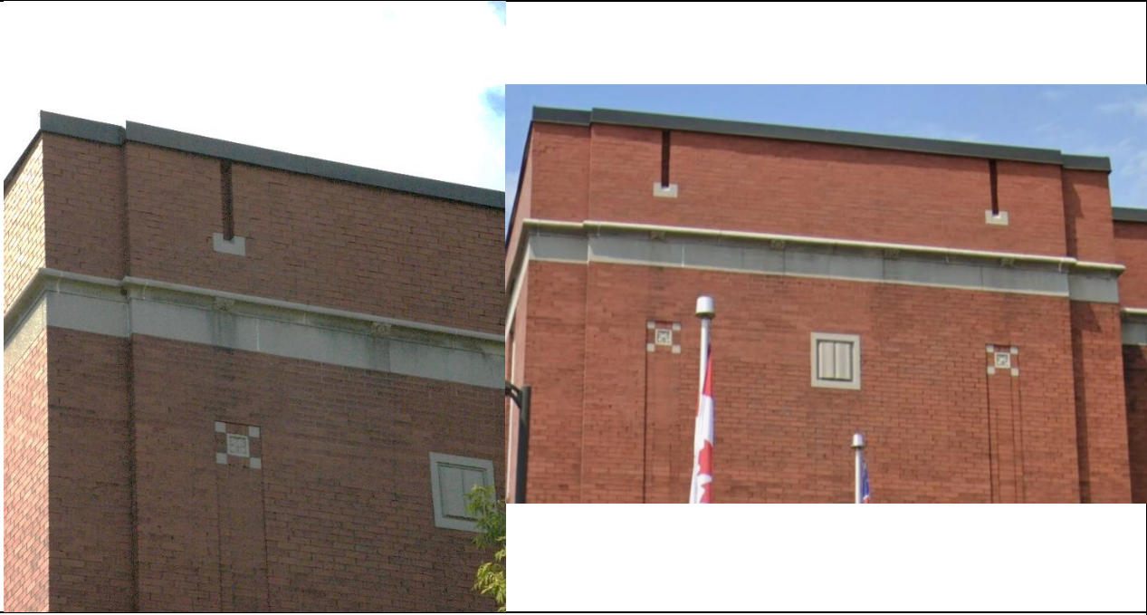
99 Strange Street