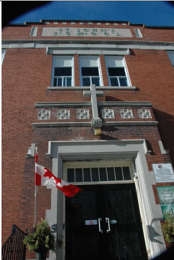
99 Strange Street