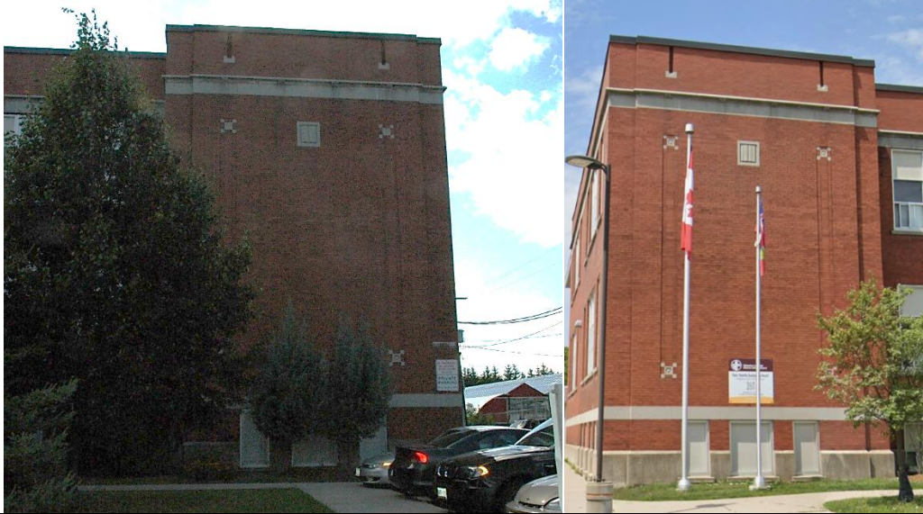
99 Strange Street