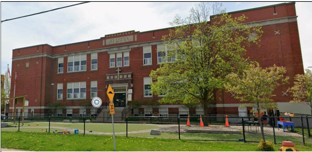
99 Strange Street