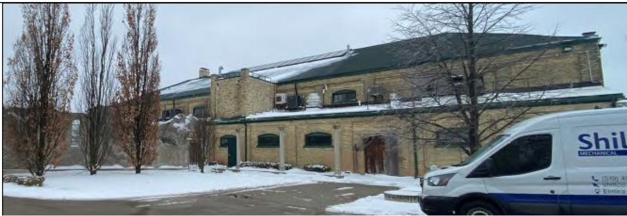
Side Elevation (East Façade)