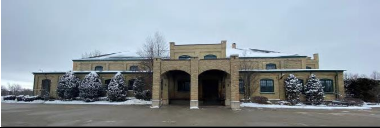
Side Elevation (West Façade)