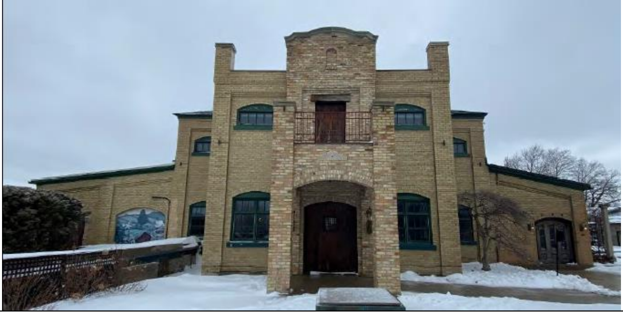
Front Elevation (South Façade) (MHBC Planning, 2023)