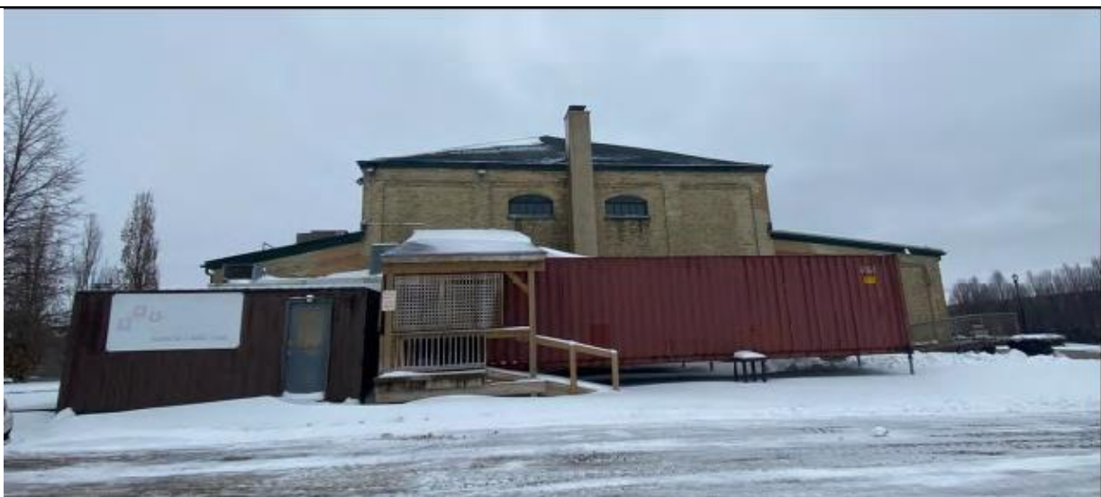
Rear Elevation (North Façade)