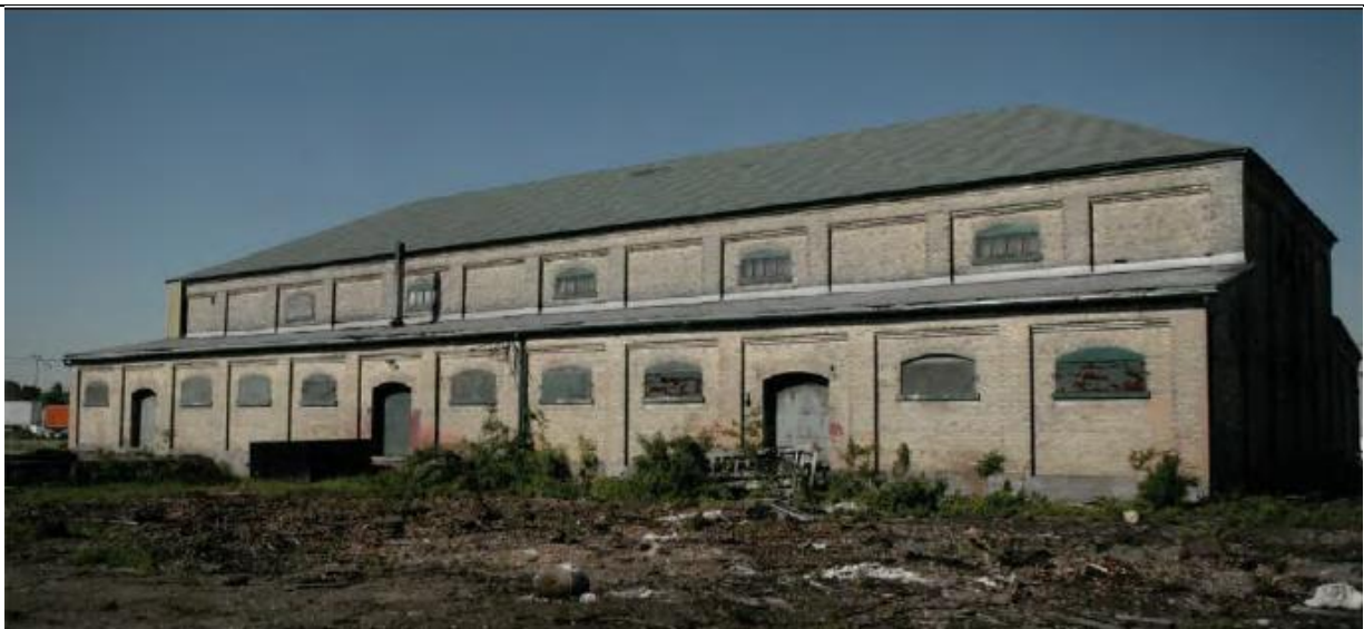
Image of 1902 warehouse building prior to 2005 alterations, facing southwest (MHBC Planning, 2023)