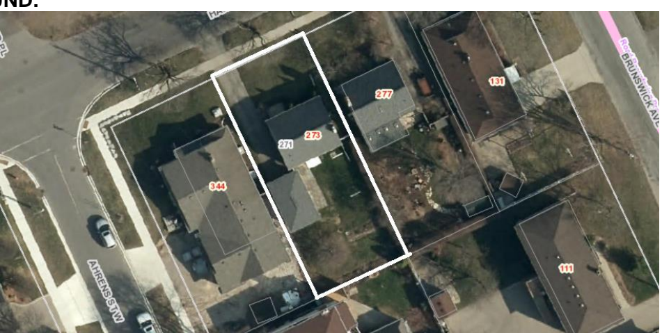
Location Map: 273 Hartwood Avenue

The subject property is located near the intersection of Hartwood Avenue and Ahrens Street West.