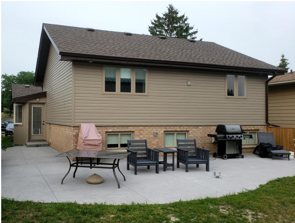
Rear Yard photo showing location of the proposed rear yard covered deck.