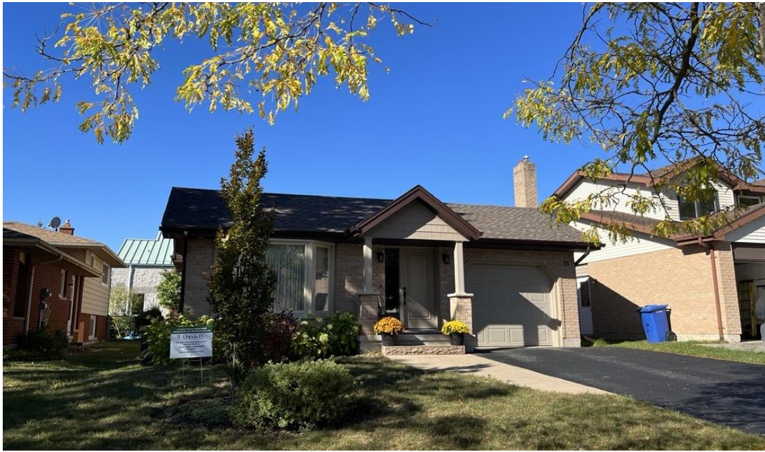
Site Visit Photo of 11 Oneida Place (subject property).