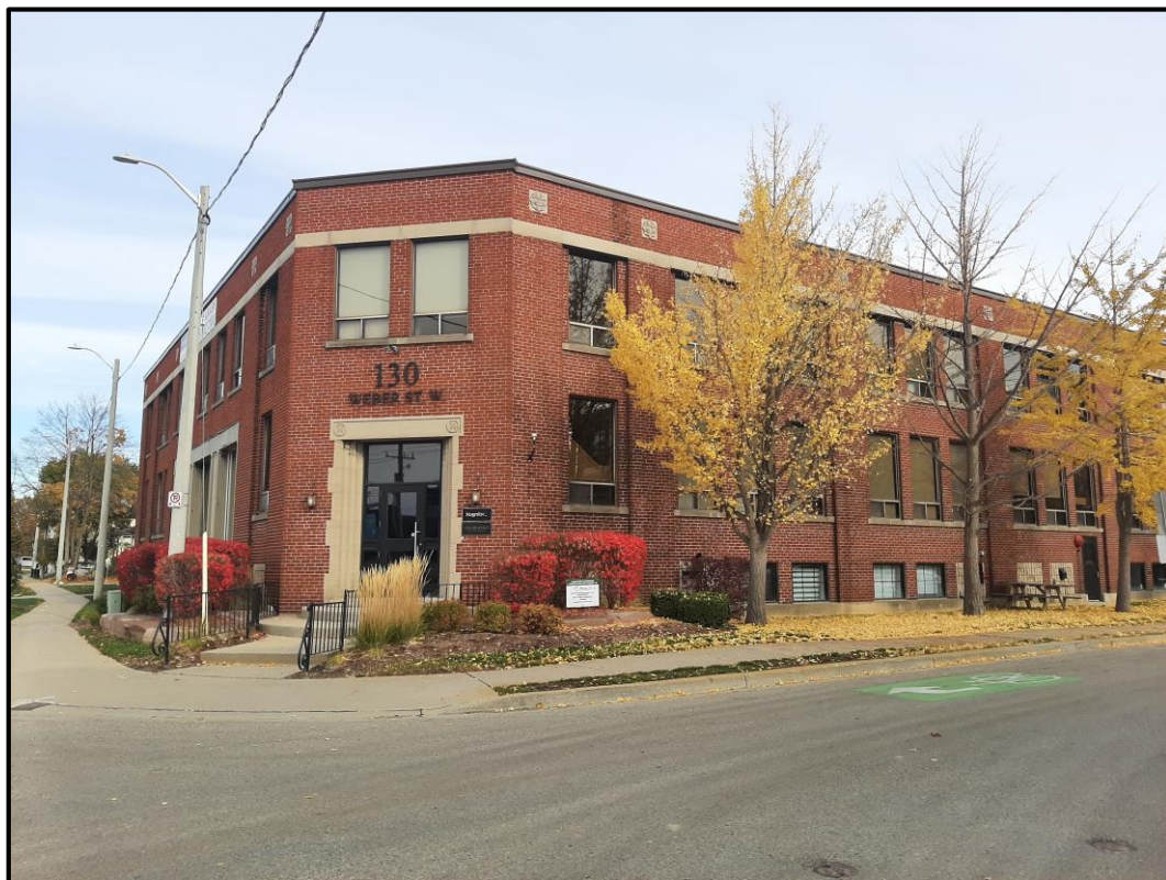
Figure 2: Street view of 130 Weber St W - south elevation