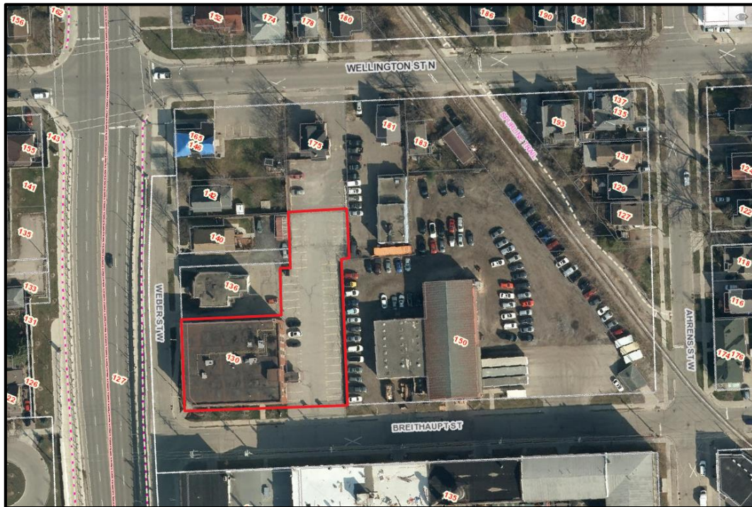
Figure 1: Location Map - 130 Weber St W

City staff conducted a site visit of the property on October 28 th , 2022.