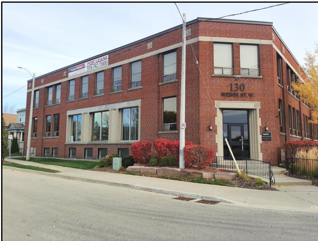
Figure 3: Street view of 130 Weber St W - west elevation