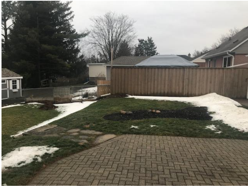
Side view with view of grade change

The application is requesting relief from Section 5.5.2b) of Zoning By-law 85-1 to permit an accessory structure to have a maximum height of 4.3 metres to the underside of the fascia instead of the maximum permitted 3 metres, to facilitate the construction of a detached garage in the rear yard of the subject property. Due to the grading of the rear yard the rear portion of the structure will be 4.3 metres in height, however the front portion of the structure will maintain the maximum permitted 3.0 metres in height to the underside of the fascia. It should also be noted that no variance would be required to Zoning By-law 2019-051 as the new regulations state that the maximum height of the shortest exterior wall shall be 3 metres, which this application would meet.