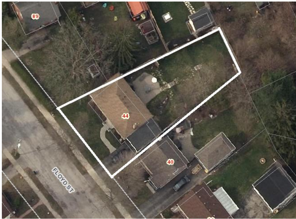
Subject Property – 44 Floyd Street