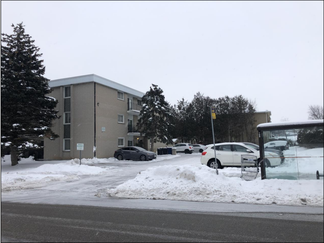
Figure 2: View of Existing Building (January 30, 2023)