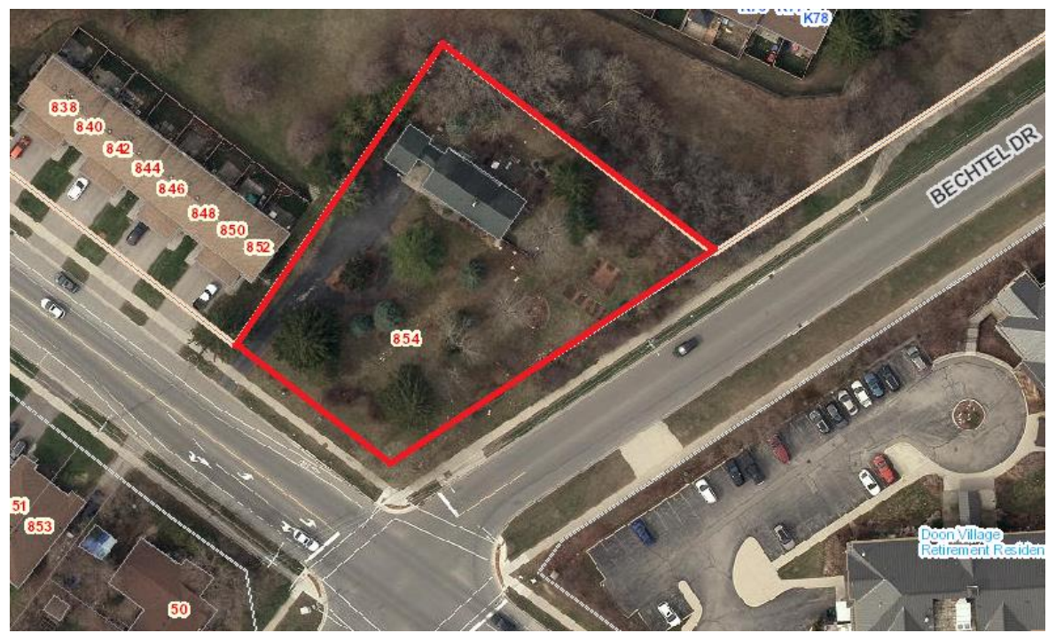
Subject Property – 854 Doon Village Road