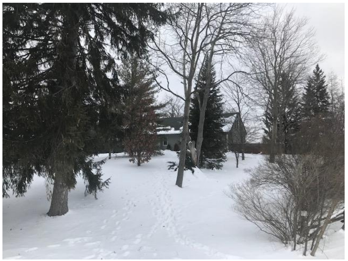
Side View - 854 Doon Village Road

The application is requesting relief from Section 7.3, Table 7-6 of Zoning By-law 2019-051 to permit a Floor Space Ratio of 0.75 instead of the maximum permitted 0.6 FSR. A minimum rear yard setback of 6.4 metres is requested instead of the minimum required 7.5 metres. The variances will facilitate the development of a 24 unit stacked townhouse residential dwelling.