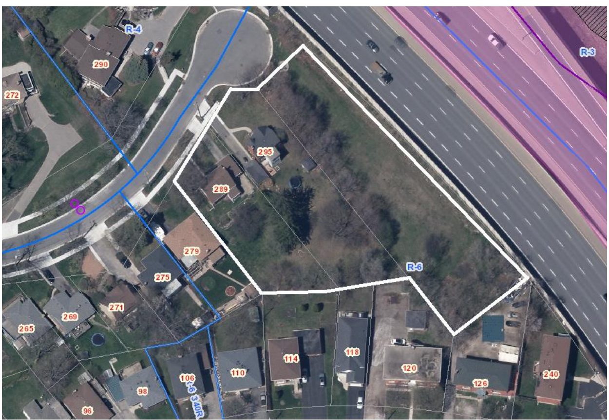
Location Map: 289 & 295 Sheldon Avenue North