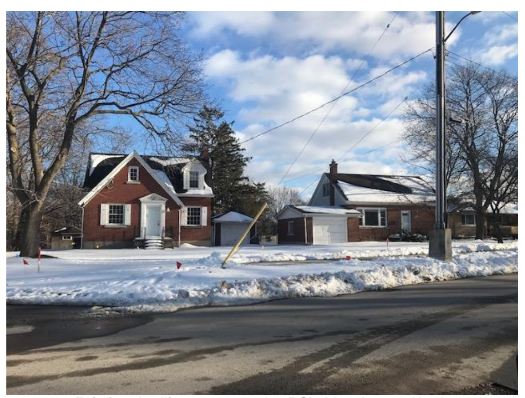
Existing dwellings at 289 and 295 Sheldon Avenue North