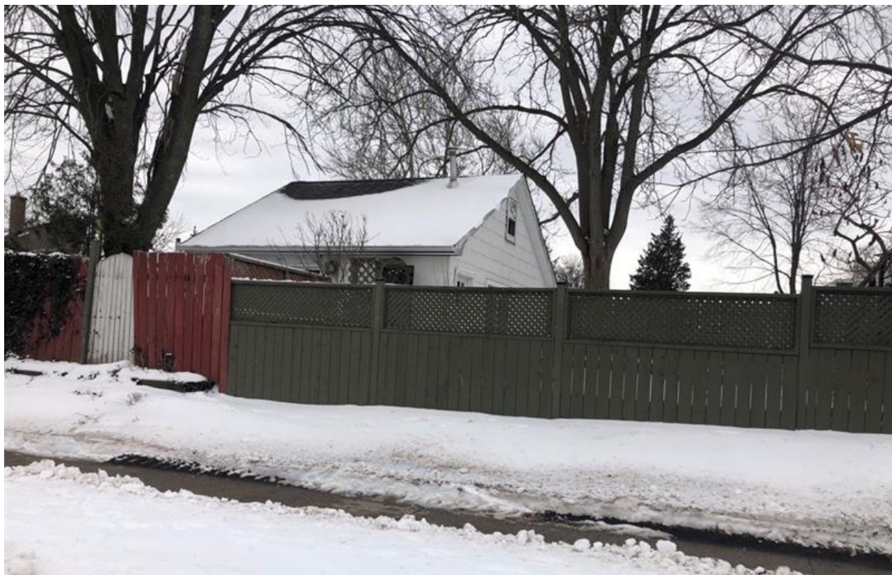
Figure 3 – Side View Photo from Site Visit