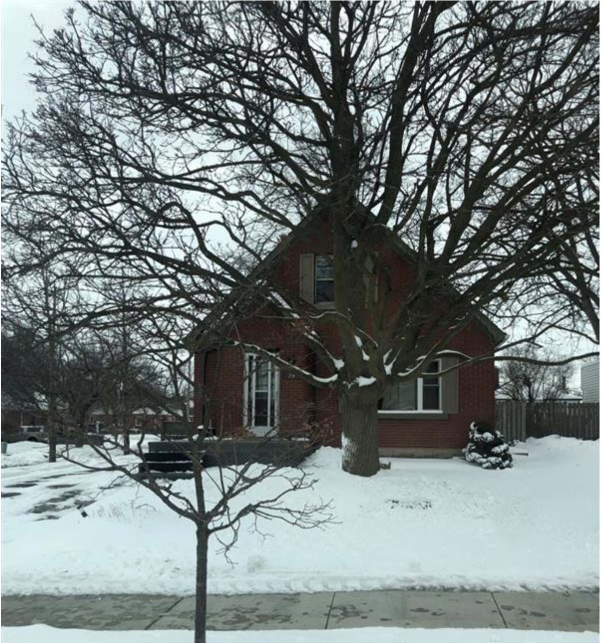
Figure 2 – Front View Photo from Site Visit