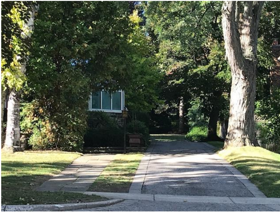
Front view and side view of property

The subject property is located on Rusholme Road, between Westmount Road West and Dunbar Road. The current use of the building is a single detached dwelling.