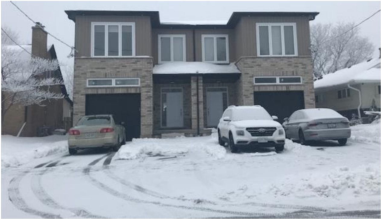
Front view – 271 and 273 Hartwood Avenue