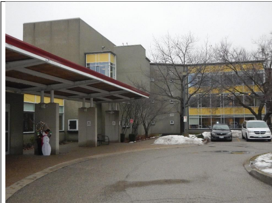
Front and Side Elevation