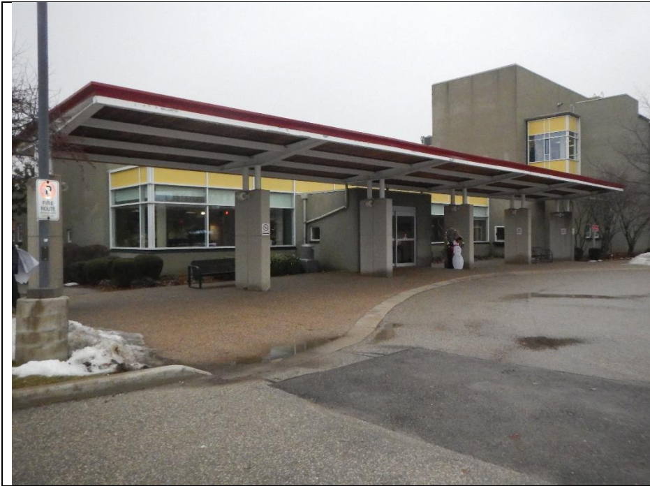
North (front ) Elevation