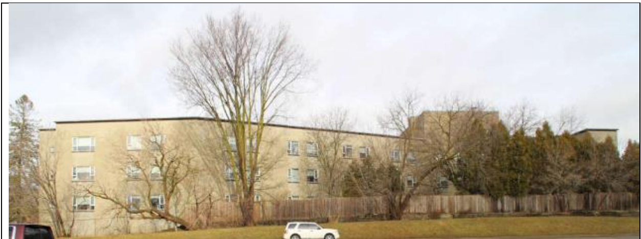
South (rear) façade