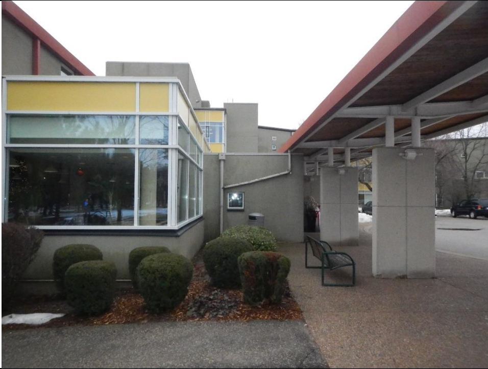
Detailing of the yellow panels and the red metal roofs