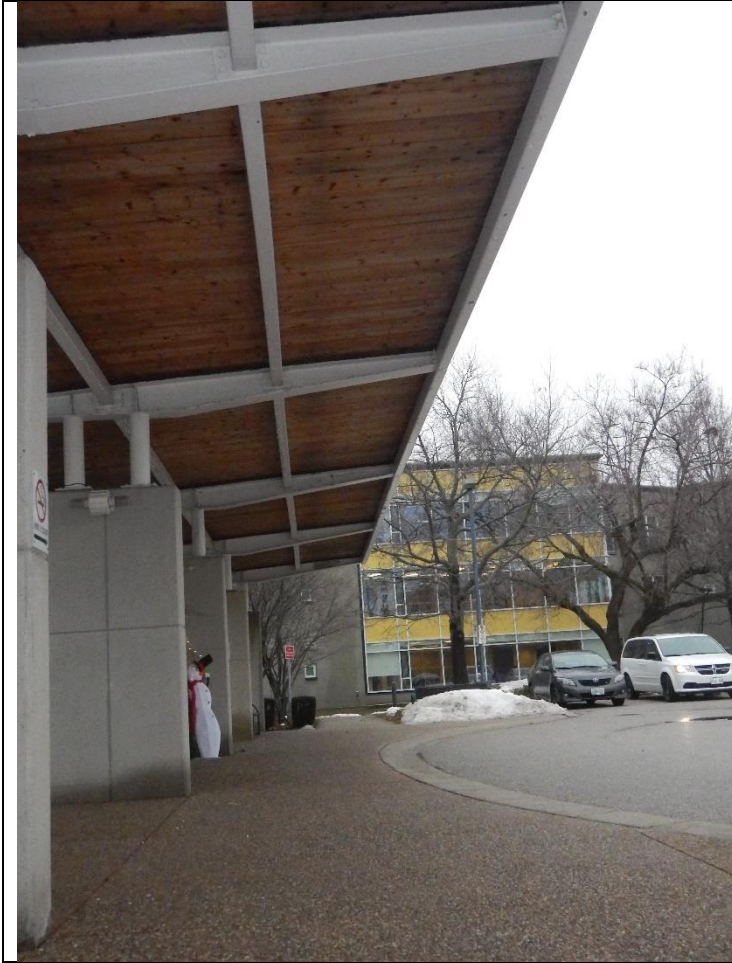
Underside of the canopy has tongue and groove wood.