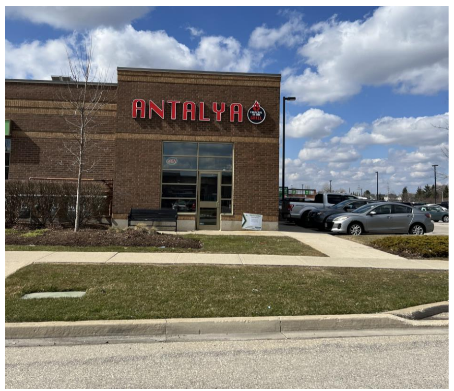
Figure 2 – Site visit photo of proposed patio location.