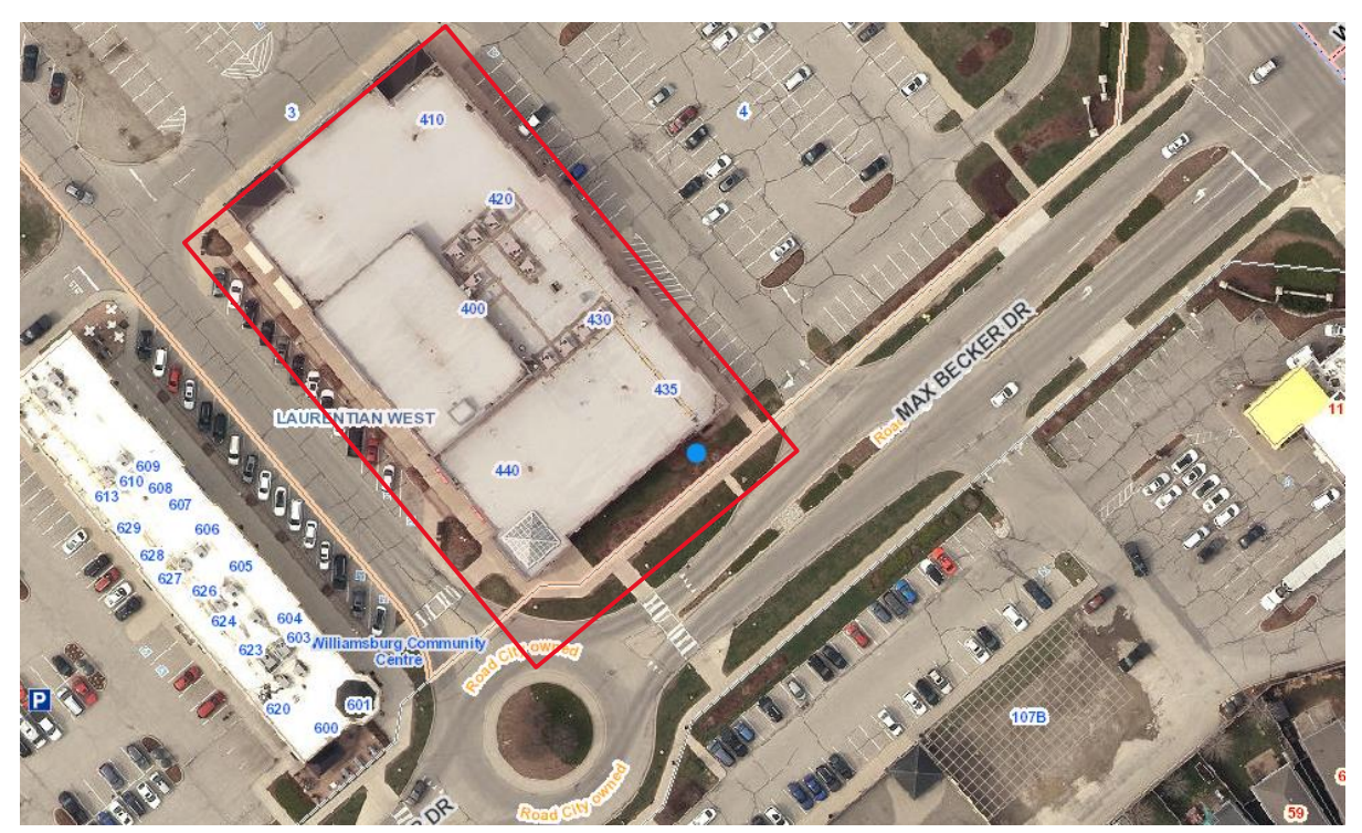
Figure 1 – Aerial View of Building 400 on Subject Property.

The subject property is identified as a 'Community Node' as per Map 2 – Urban Structure and is designated as 'Commercial' on Map 3 – Land use in the City's 2014 Official Plan.