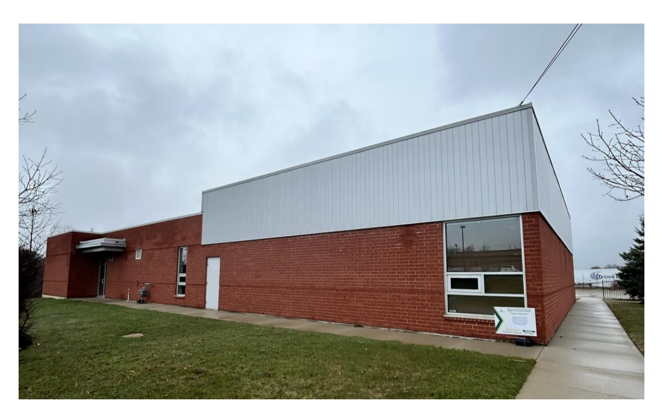
Figure 3: Front view of the subject property.