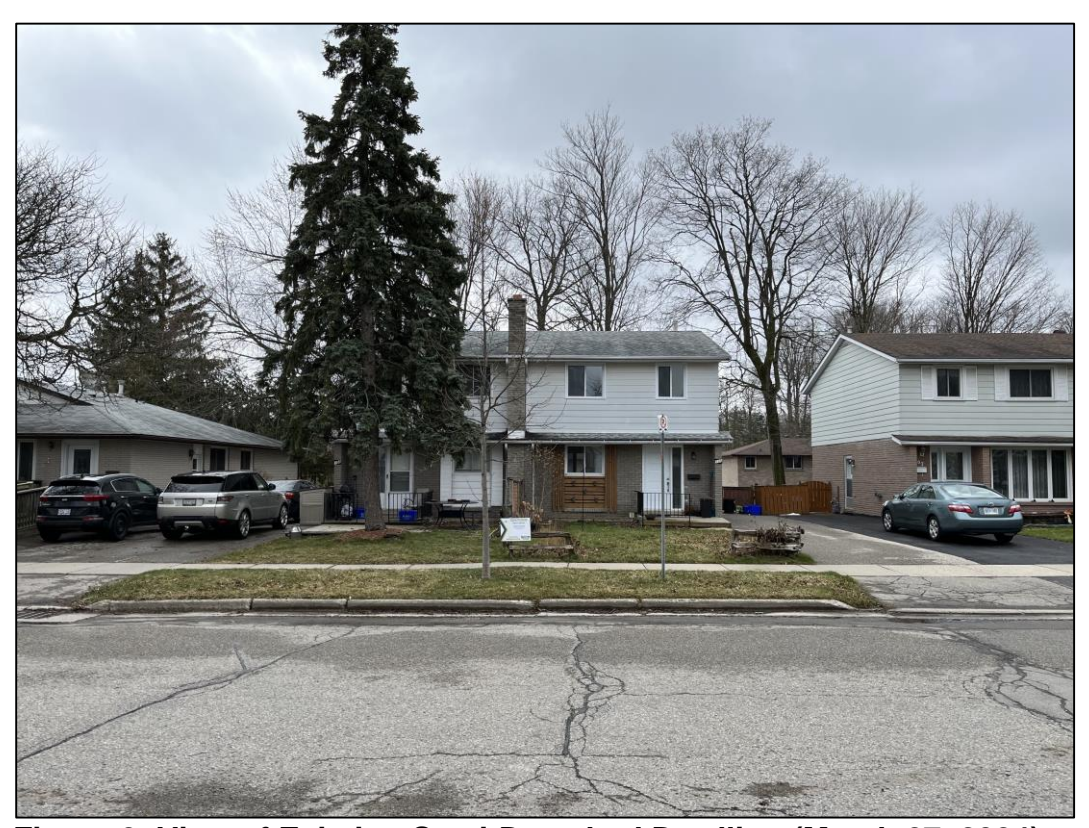
Figure 2: View of Existing Semi-Detached Dwelling (March 27, 2024)