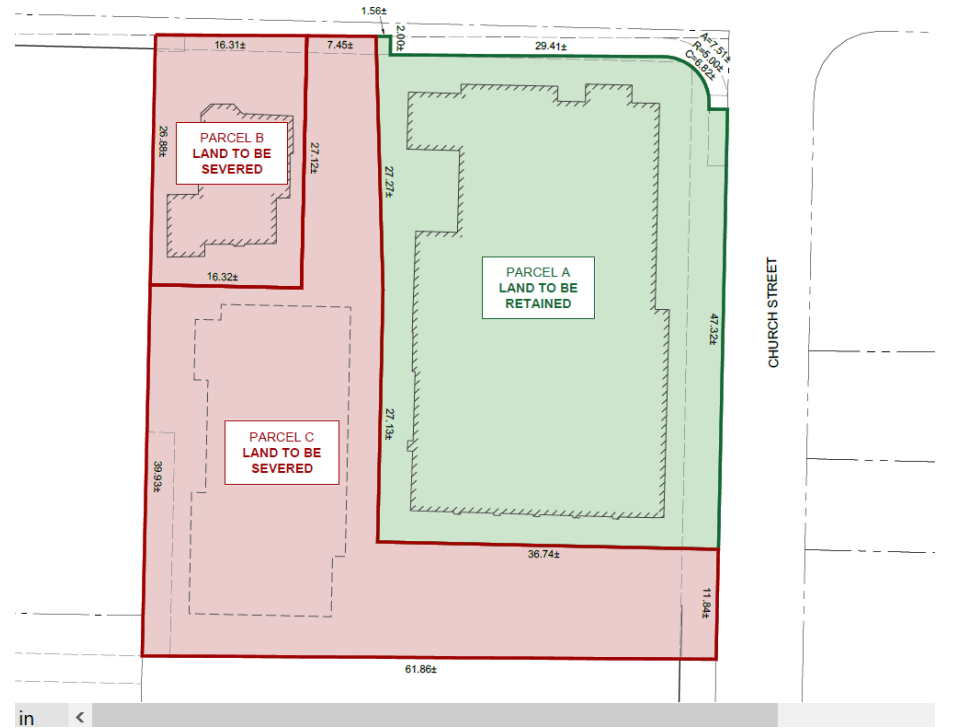
Figure 3 – Plan for Consent Applications B2023-013 to B2023-015.