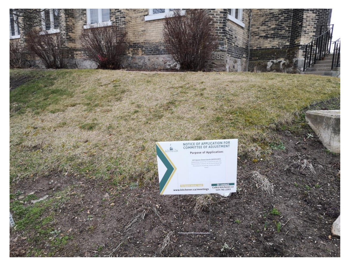
Figure 2 - Notice Sign on 137 Queen Street South.