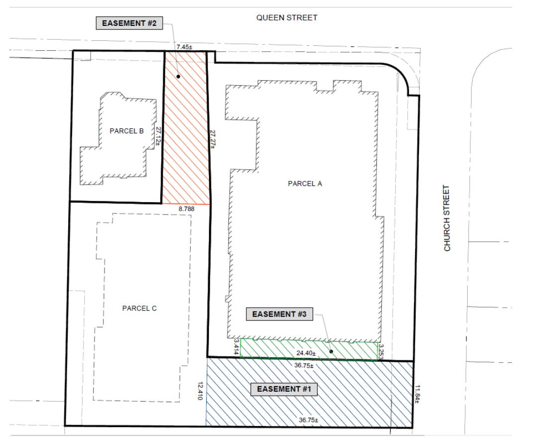
Figure 4 – Plan for Easements Consent Applications B2023-013 to B2023-015