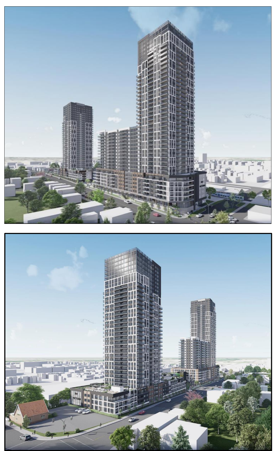
Figures 4 and 5 – Proposed Building Renderings