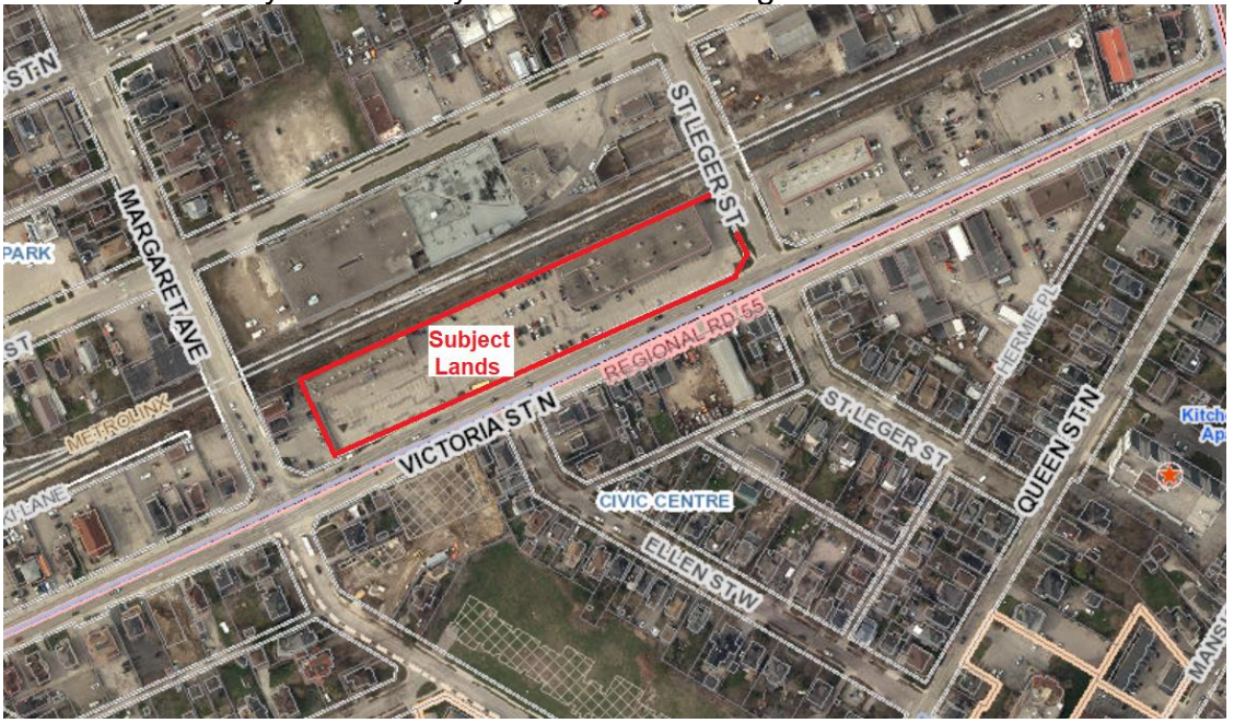
Figure 2 – Location Map: 236-264 Victoria Street North

The subject lands are addressed as 236-264 Victoria Street North Road and are situated within an 'Urban Corridor' as identified on the City's Urban Structure map in the Official Plan. The subject lands are comprised of two parcels of lands municipally known as 236 and 264 Victoria Street North. The consolidated parcels form large rectangular parcel of land 1.18 hectares (2.92 acres) that have frontage both on Victoria Street North and St. Leger Street and directly abuts the Metrolinx rail line to the north of the subject lands. The subject lands are currently developed with a commercial office building at 236 Victoria Street and a fitness centre (formally LA Fitness and now Grand River Rocks climbing gym) at 264 Victoria Street North with large surface parking lots in front on the existing buildings. The surrounding neighbourhood is developed with a range of commercial, industrial and institutional uses along with a mix of high, medium and low density residential dwellings. The site is well buffered from existing low rise residential uses and does not currently contain any residential dwellings.