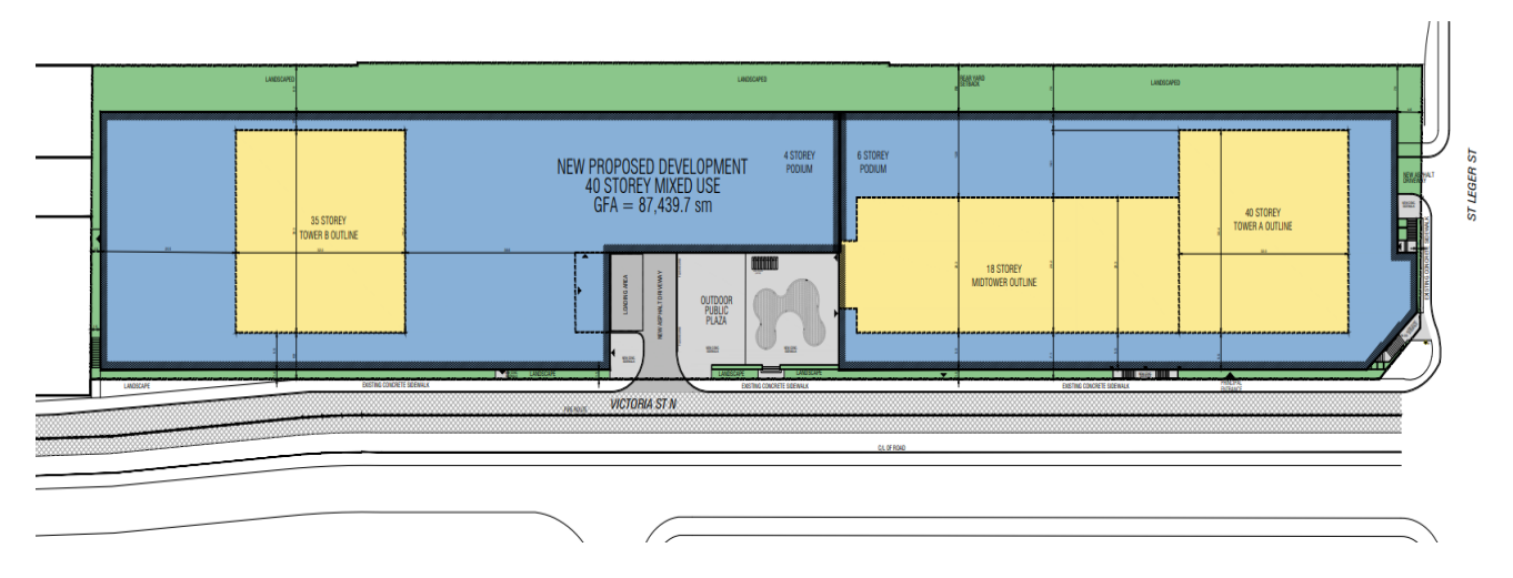
Figure 3 – Development Concept Site Plan

To facilitate the development of the subject lands with the proposed development concept, an Official Plan Amendment and a Zoning By-law Amendment are required to amend the land use policies and zoning regulations of the subject lands as the existing Official Plan policies permit a maximum building height of 15 storeys and the zoning permits a maximum building height of 10 storeys or 32 metres with a maximum floor space ratio of 4.0.